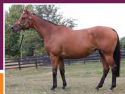
ZABEEL MARE WITH A COLT AT FOOT AND IN FOAL.