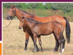
TAVISTOCK MARE WITH A FILLY AT FOOT BY BURGUNDY.