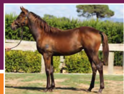
WEANLING FILLY BY SCARED FALLS.