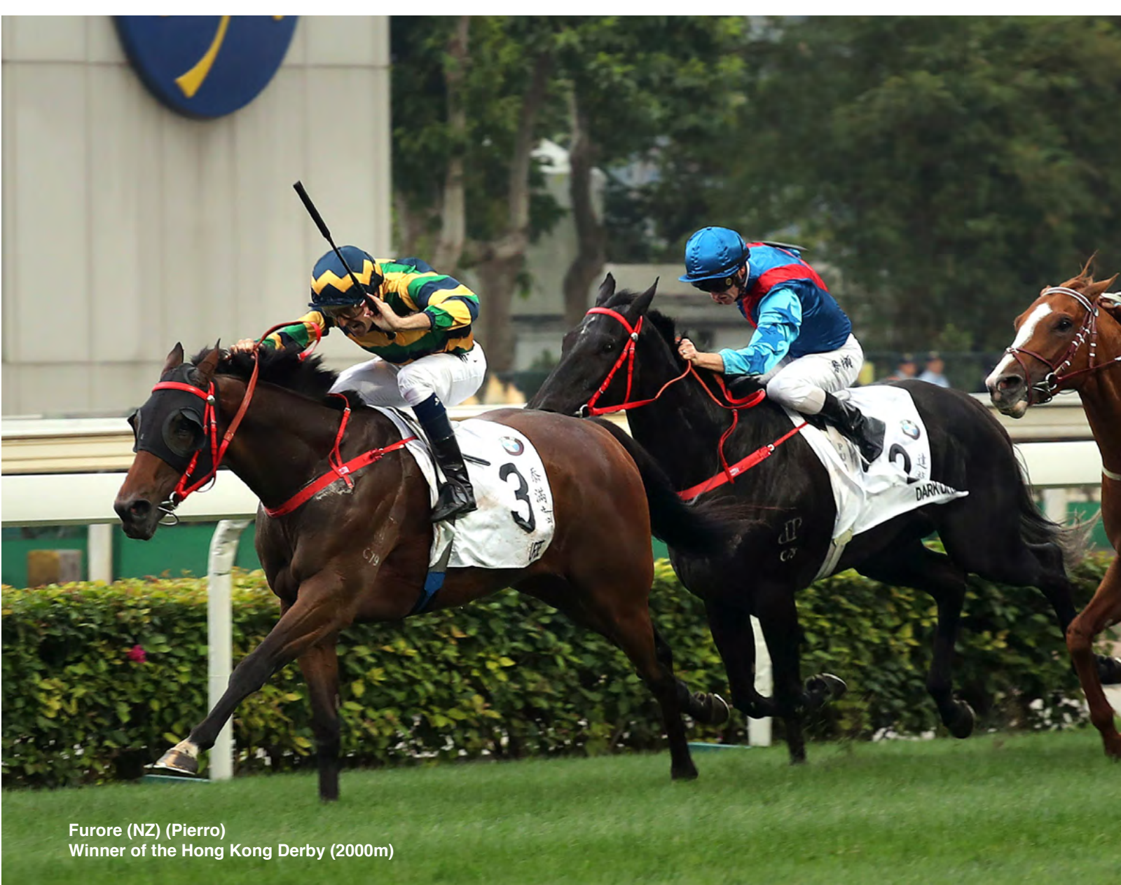
Furore (NZ) (Pierro) Winner of the Hong Kong Derby (2000m)