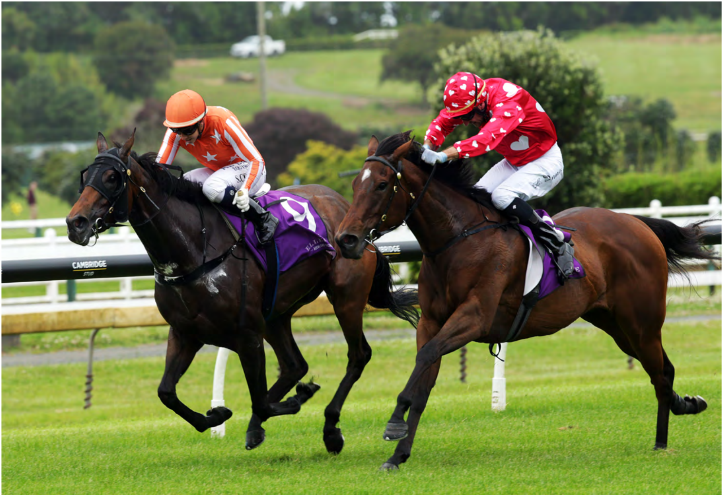
Espresso Martini (outer) pictured winning the Gr.3 Trevor Eagle Memorial at Ellerslie

Promising three-year-old Espresso Martini (NZ) (High Chaparral) resumed from a brief break in fine fashion when she dealt to her older rivals over 1400m at Tauranga on Saturday.