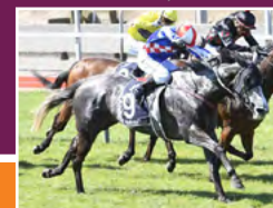
GROUP PERFORMER BY MASTERCRAFTSMAN.

BIDDING CLOSSES FROM 7PM TONIGHT - REGISTER ONLINE NOW TO BID