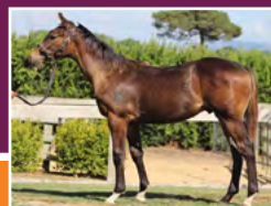
WEANLING COLT BY TELPERION 1/2 TO FIVE WINNERS.