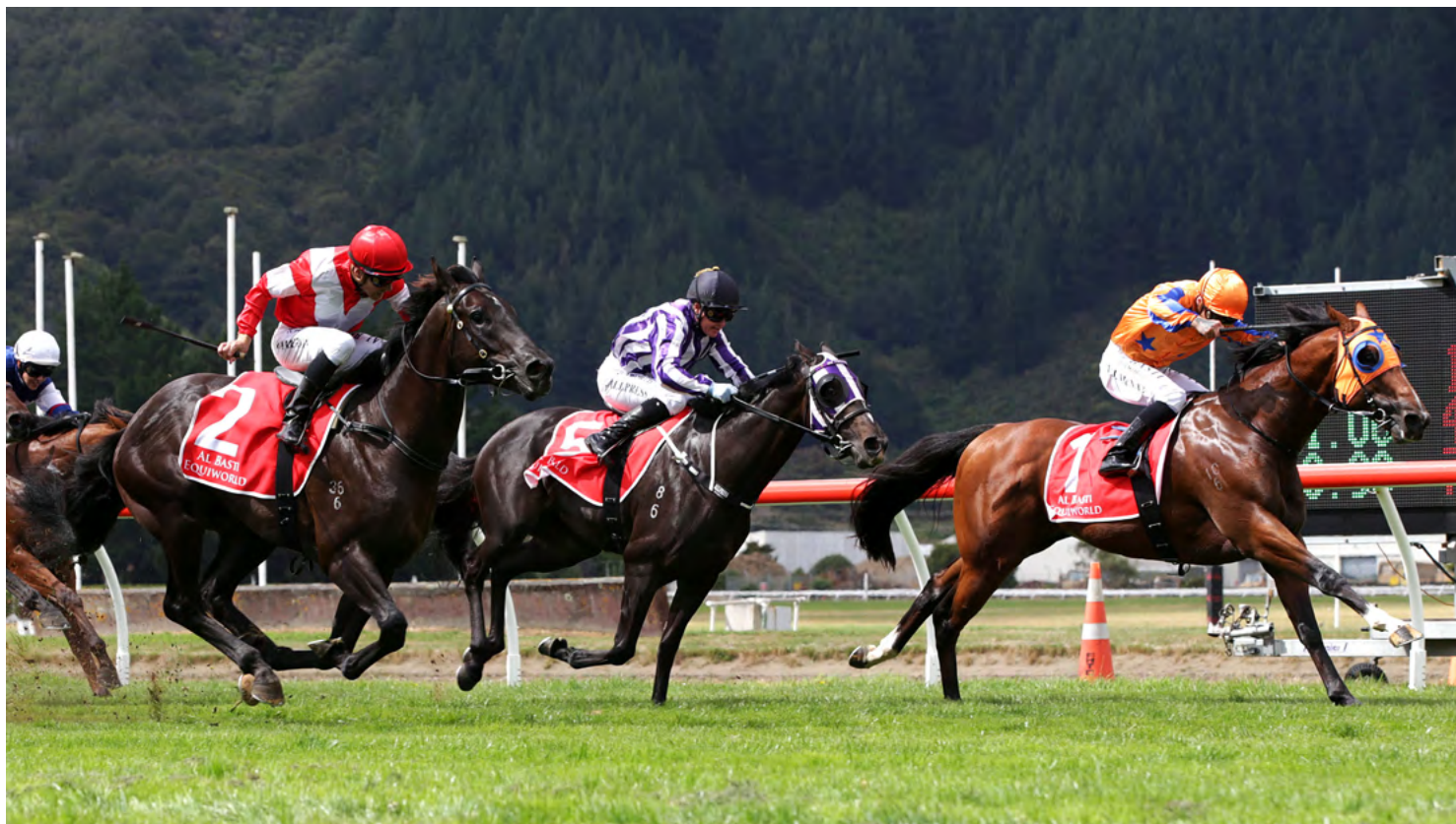
Exciting two-year-old Equinox (inner) adds a second Trentham victory to his resume

Reminiscent of his impressive debut, two-year-old colt Equinox (NZ) (Exceed And Excel) once again showed his liking for the Trentham track with a hard-fought victory at the venue on Saturday.