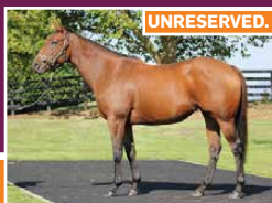
SAVABEEL MARE IN FOAL TO ZACINTO.