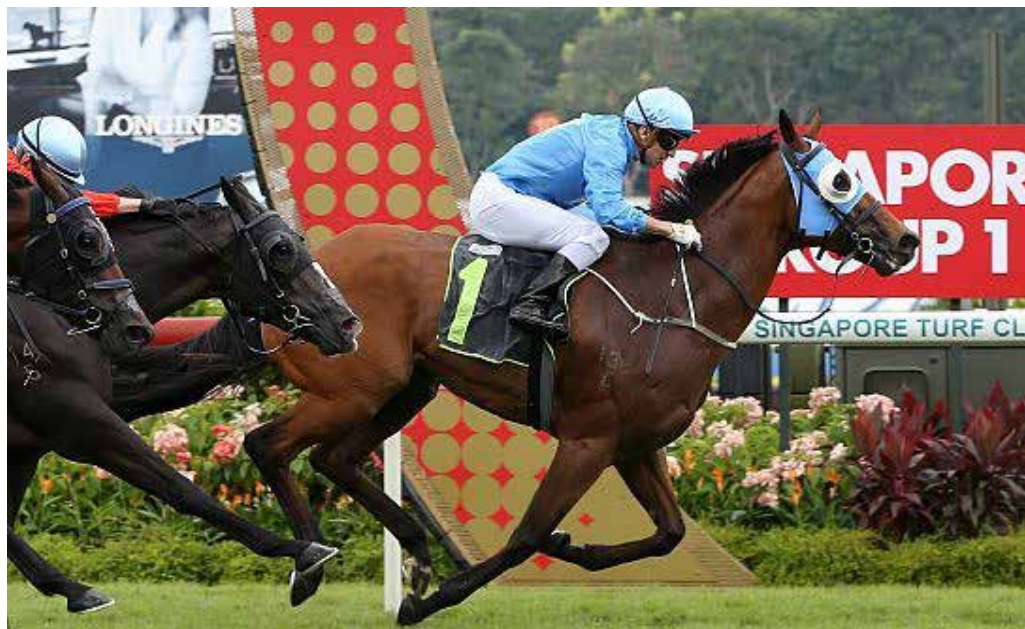
On Line cruises to his maiden victory at Kranji