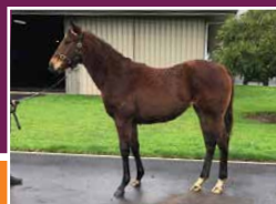
SHOWCASING FILLY OUT OF A WELL-RELATED KEEPER MARE.