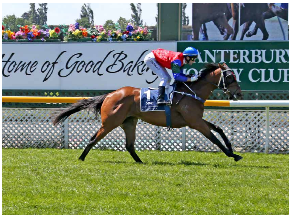
Exciting galloper More Wonder is ready for a break-out season in 2019/20