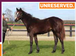
VADAMOS FILLY OUT OF A HALF TO QUINTESSENTIAL.