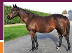
WINNER & DAM OF WINNERS IN FOAL TO TIME TEST.

CONTACT THE TEAM FOR MORE INFORMATION ON +64 9 296 4436.