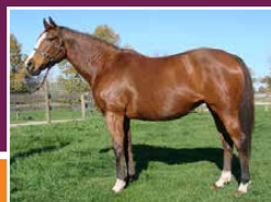
HIGH CLASS INTERNATIONAL MARE IN FOAL TO ALMANZOR.

Bidding set to close starting with Lot 1 from 7pm tonight!