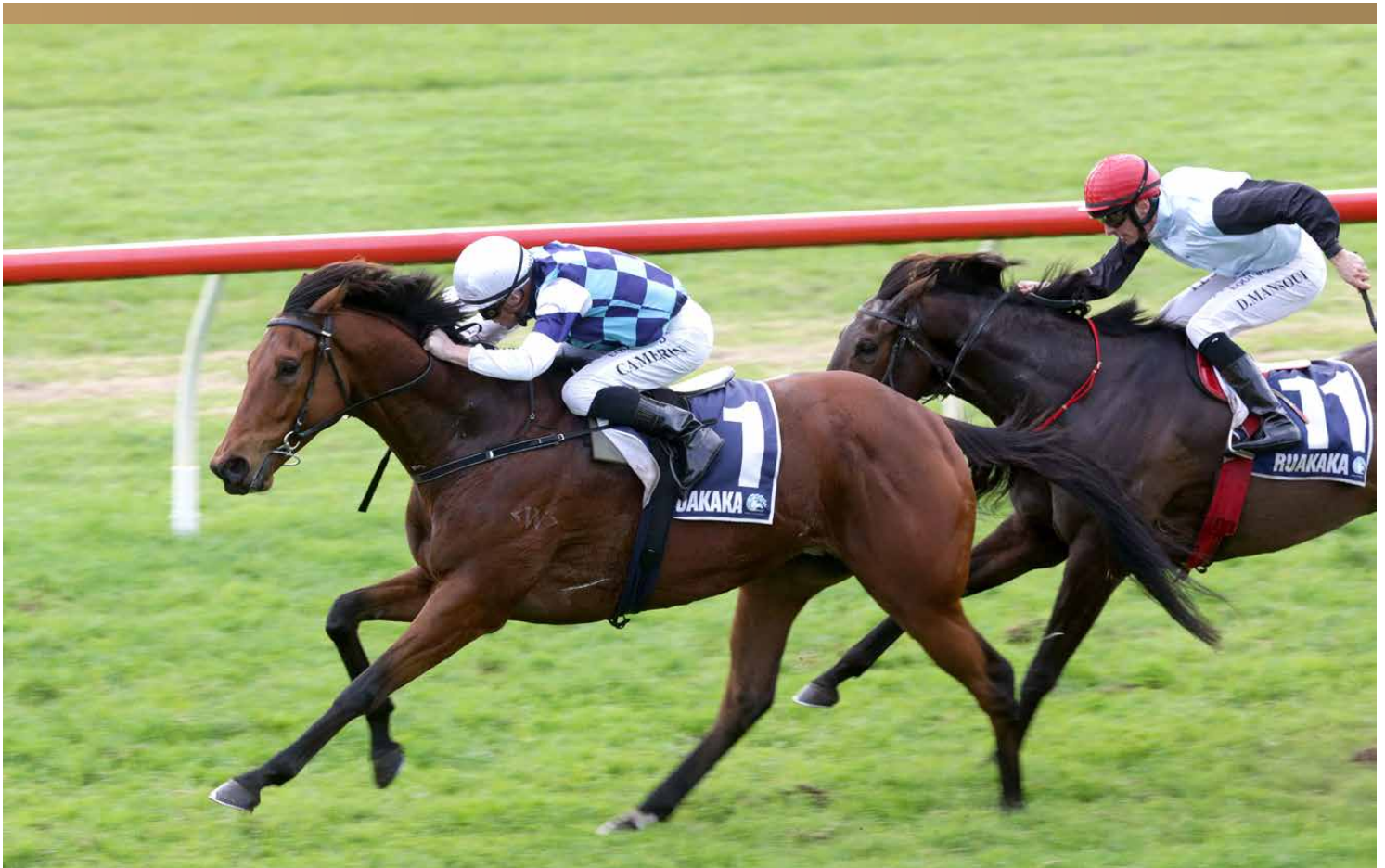
Mac Attacka cruises to the line at Ruakaka as he notches up another impressive victory