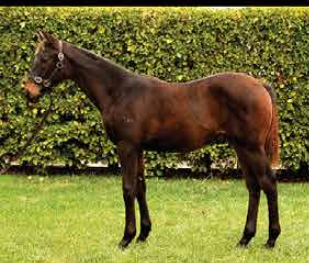
ex North and South $30,000 Highline Thoroughbreds