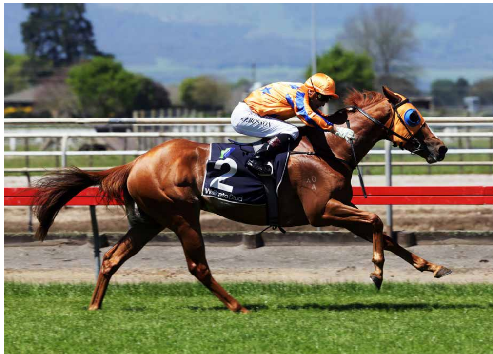
Quality galloper Te Akau Shark will be one of the star attractions at Monday's Te Rapa trials meeting