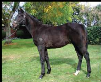
ex Essayez $34,000 Hallmark Stud