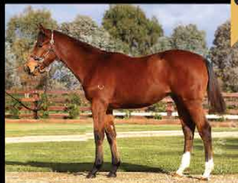
ex Crafty Miss Aus $50,000 Spicer Thoroughbreds