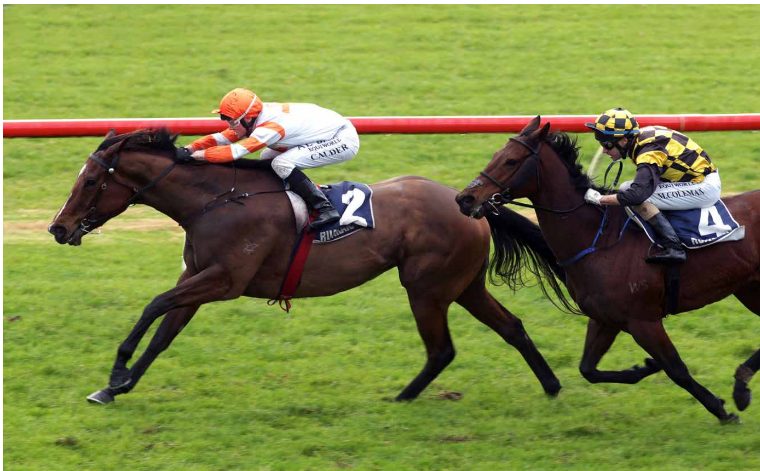
Hello It's Me returns to winning form at Ruakaka