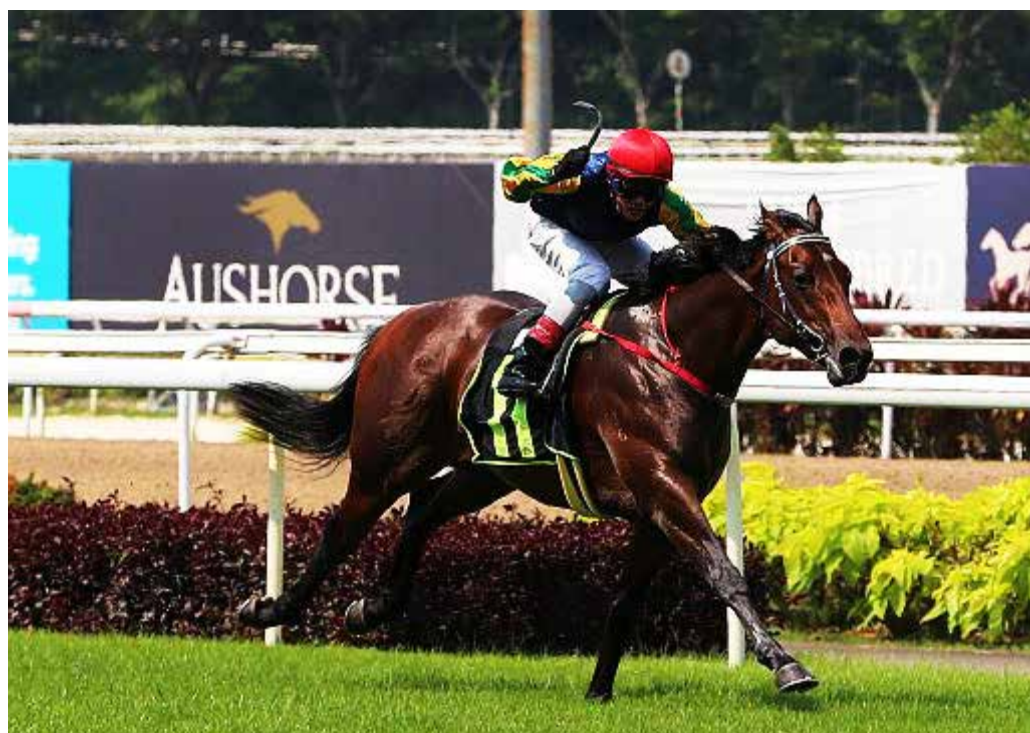
Count Me In scores on debut at Kranji